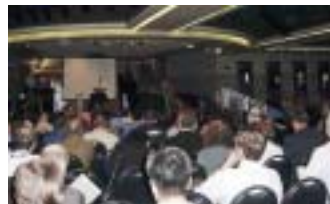
A Morning Session Audience