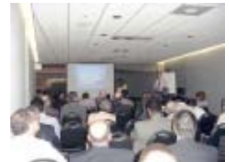
An Afternoon Session Audience